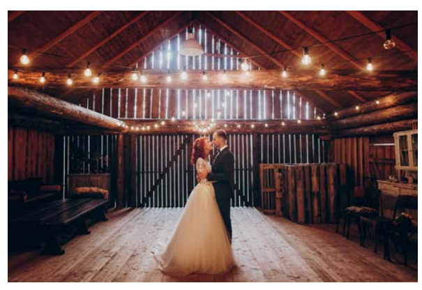
The Farm allows for a range of educational opportunities and social events such as farmer training workshop, education gardens and weddings.