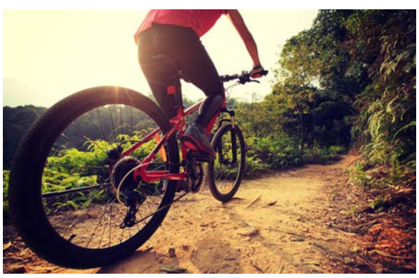
Fanita Ranch's extensive trail system creates a highly connected community with opportunities for walking, hiking and biking.